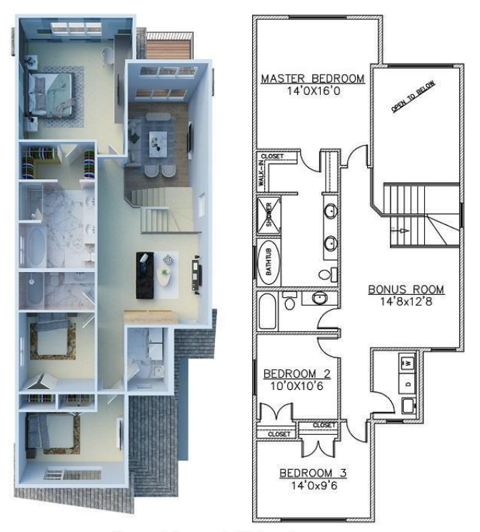
Upper Floor - 1147 sq.ft.

DATA IS DEEMED RELIABLE BUT IS NOT GUARANTEED ACCURATE BY THE REALTORS® ASSOCIATION OF EDMONTON. COPYRIGHT 2025 BY THE REALTORS® ASSOCIATION OF EDMONTON. ALL RIGHTS RESERVED. Trademarks are owned or controlled by the Canadian Real Estate Association (CREA) and identify real estate professionals who are members of CREA (REALTOR®, REALTORS®) and/or the quality of services they provide (MLS®, Multiple Listing Service®)