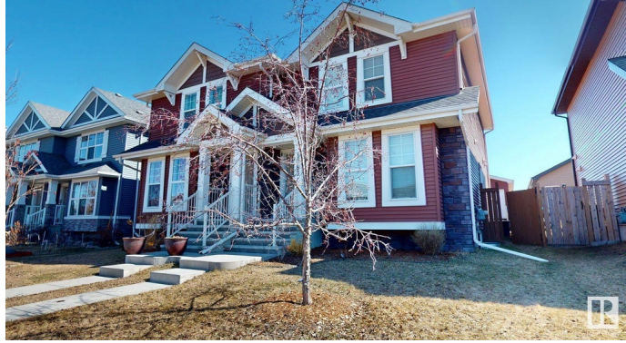
1083 Watt Promenade SW Edmonton