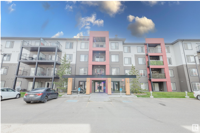
108-340 Windermere Rd NW, Edmonton, AB